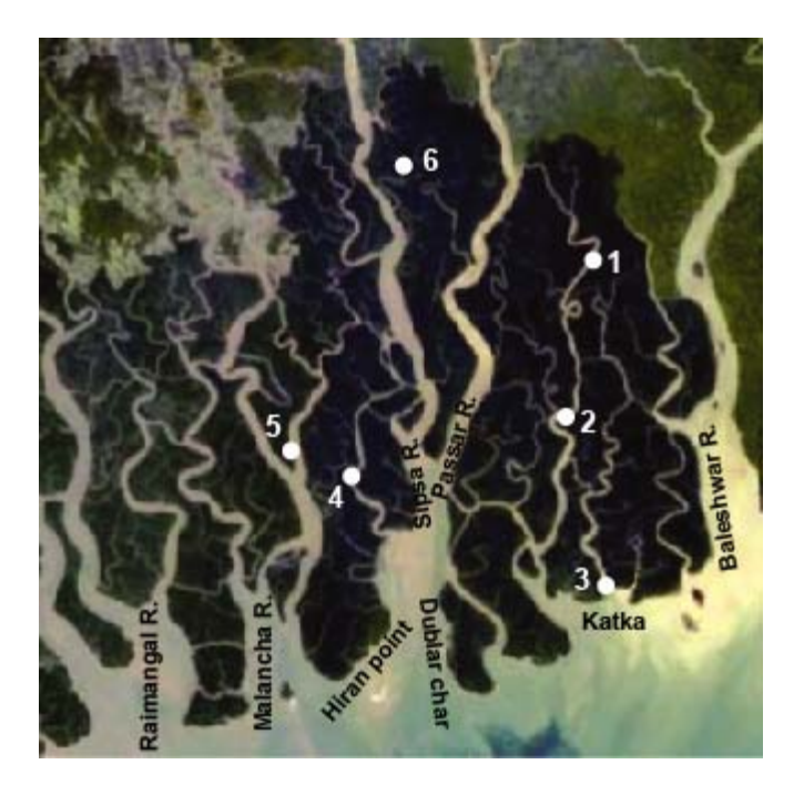
Fig.1. Satellite image of the SMF in February 2010, showing sampling sites. The darker colour towards the north-east indicates denser forests.

Remote Sensing and Geographic Information Systems were used to explain changes in Nalianala (Khulna) and Chandpai Forest Range. Landsat TM data of 12 January 1989 and Landsat ETM+ of 26 November 2000 and 2010 (<u>http://glcf.umd.edu</u>) were rectified and geo-referenced to the World Geodetic System 1984 and projected to the Universal Transverse Mercator (UTM) map projection system and were compared. The image processing was done using Erdas Imagine 9.1 software produced by Leica Geosystems. The images were downloaded as individual bands 1, 2, 3, 4, 5, 6 and 7 respectively and stored separately. The data obtained from LANDSAT images on the SMF are raster data which were converted into vector data. Soil samples from each plot were collected in polyethylene bags from 0-10, 10-20 and 20-30 cm depths and five replicates were taken. To determine salinity, 20 g soil in 50 ml distilled water was stirred homogeneously and was allowed to settle down. Salinity of the soil extracts were measured using hand refractometer.